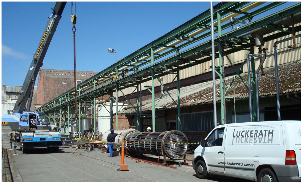
Revision of various heat exchangers

For several years Lückerath is active in four market segments. These are the main segments of our products and services. To clarify which products and services we deliver every day, we have chosen a project from the segment "Graphite Specials".