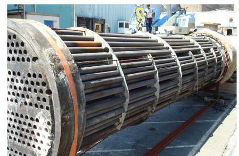
Inside of a heat exchanger

For more information about the revision or replacement of heat exchangers visit our website at www.Luckerath.com